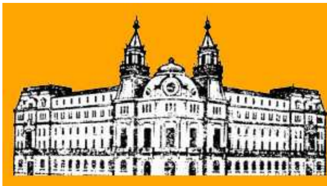
Ministry of Agriculture and Food of the Republic Bulgaria