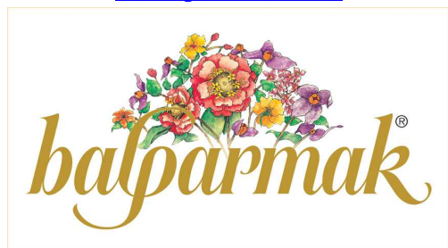
Balpamak Honey, Turkey www.balpamak.com.tr