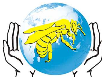
World Save Bee Fund www.save-bee.com