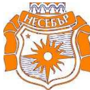
Municipality of Nessebar