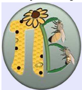
Primavet Ltd., Bulgaria www.primavet.com