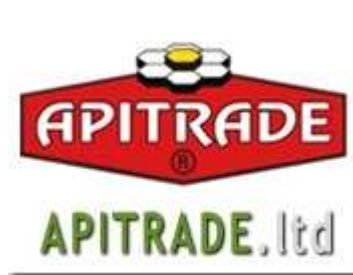
Apitrade, Bulgaria www.apitrade.bg